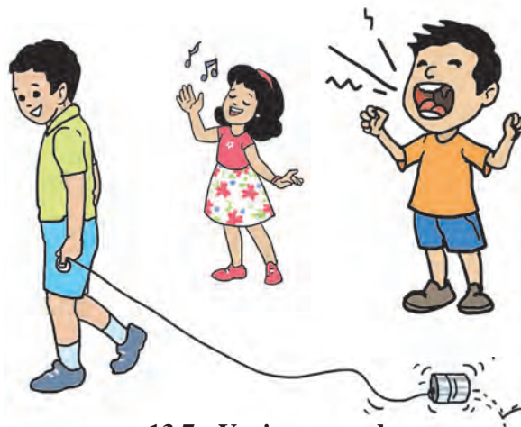
13.7 : Various sounds

A loud sound is harsh to the ear. Such sounds produce noise.