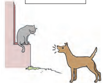
13.1 : Examples of various sounds

1. Which sounds do you hear during the recess in the school?