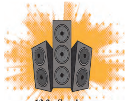
13.2 : Speakers

Put off the music. What do you feel now?